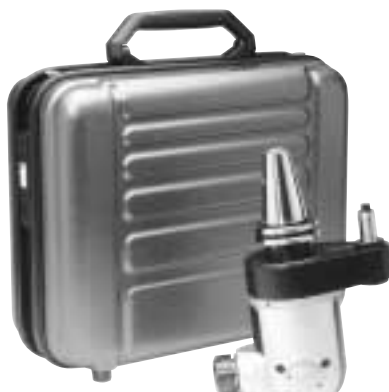
PVI Angle Head with Case.