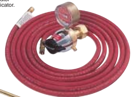
Model 6505 0030 Shown